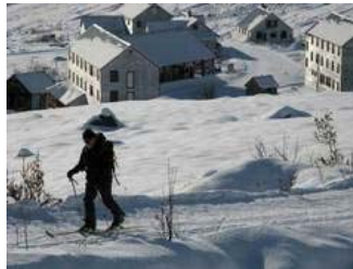
enlarge With $6 million in federal funds to build roads in Hatcher Pass, a ski resort may be closer to reality.

PALMER -- The Matanuska-Susitna Borough has finally received clearance to use $6 million in earmarks it got from the federal government toward building roads in Hatcher Pass.