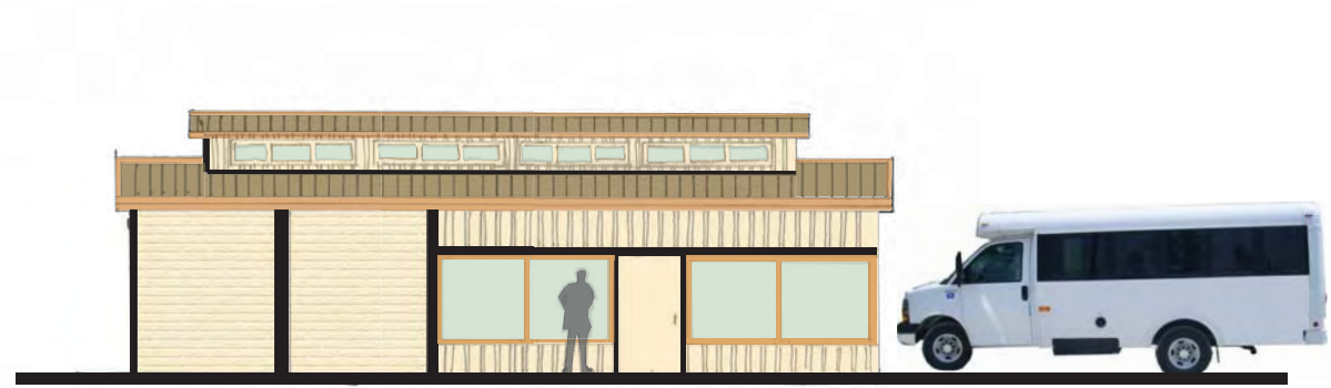
FTA PROPOSED COMFORT STATION AND TRANSIT FACILITY ELEVATION